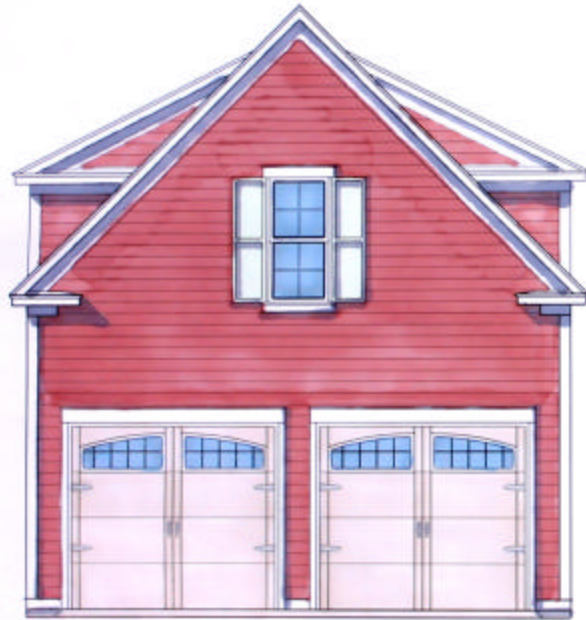
Double Door Garage with upstairs Apartment

Garage Area : 672 Sq Ft Apartment : 538 Sq Ft