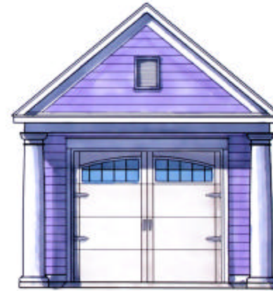
Single Door Garage

Garage Area : 672 Sq Ft Apartment : 538 Sq Ft